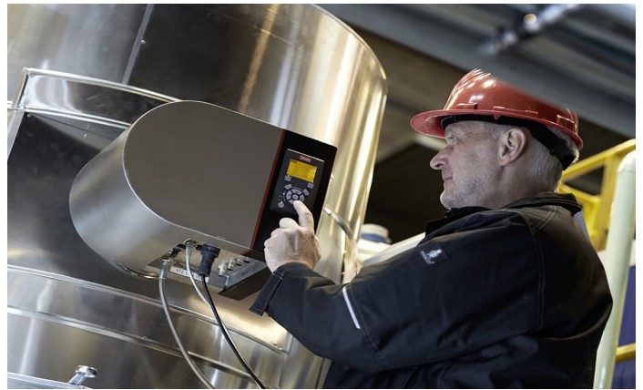
Figure 1. An Ocean Insight Maya2000 Pro spectrometer assembly has been integrated into a maritime emissions sensor for use at sea.

Ocean Insight partnered with Denmark-based Danfoss IXA to develop extremely robust sensor systems for the maritime environment. We customized the spectrometer assembly to withstand the high temperatures and vibration conditions experienced on cargo ships and in exhaust stacks ( Figure 1 ).